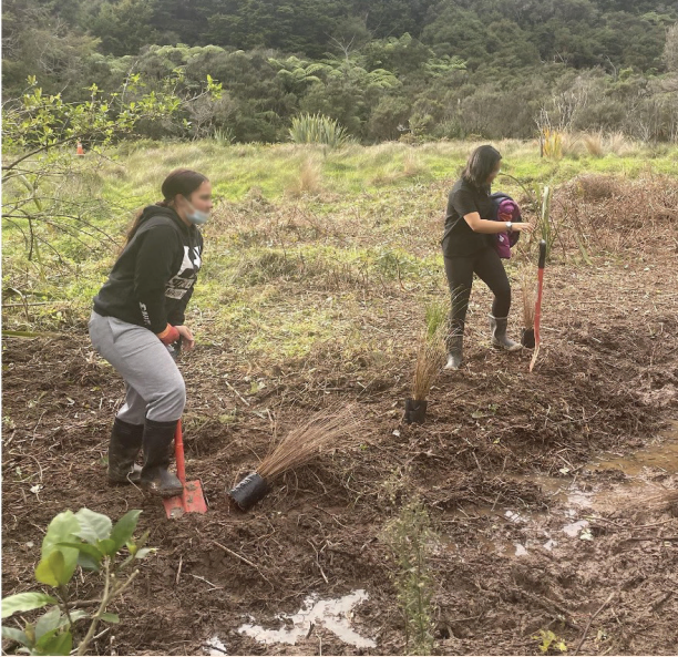
Planting native grasses along recently cleared area, that had previously been concealed by 2 meters tall invasive blackberry.

cultivation skills and raise seedlings for crops as well as native trees for the ngāhere, and we are supporting them in making this happening them in making this happen.