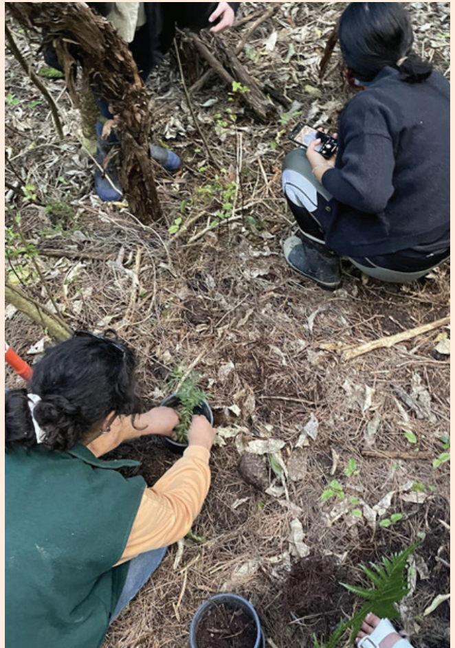
Potting up self seeded Kahikatea and Tōtara for relocation.

We have been trying to find as many free inputs as possible to begin layering and building up organic material such as coffee chaff, manure, wood chips and leaf mulch. We used old billboard material as tarps to suppress the grass until spring time. This has been a long tedious process, as removing staples from the tarps is a time consuming task. It took us several attempts to properly secure the tarps in the wind and weather, and to really ensure that all the grass is being killed off, without gaps in between.