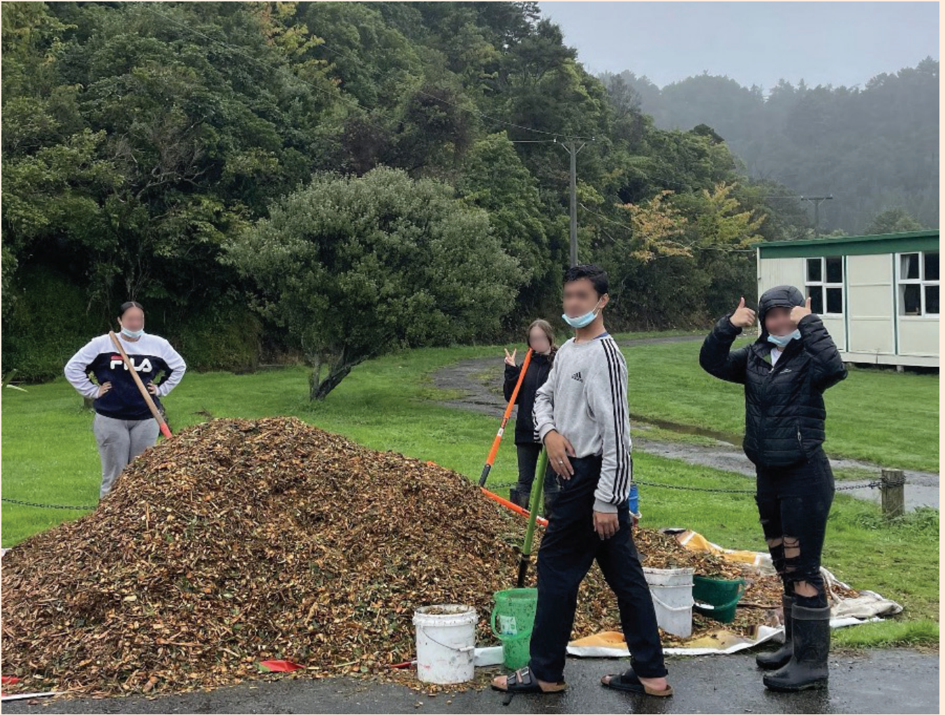
On our way to mulch ngā rākau whai hua

A central part of our work in spending time at this kura has been to strengthen relationships and build trust as we continue in this work together and as our vision for the māra grows. The school principal has been generous in supporting this project through some initial infrastructure, so we are looking forward to receiving our tunnel house, compost bins soon as well as some berries and fruit trees in the near future. From conversations as a collective, it seems we are all keen to support the opportunities to soon grow enough food to feed the whānau.