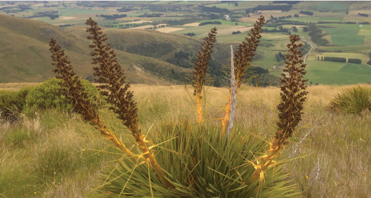
Tarama growing in the high country