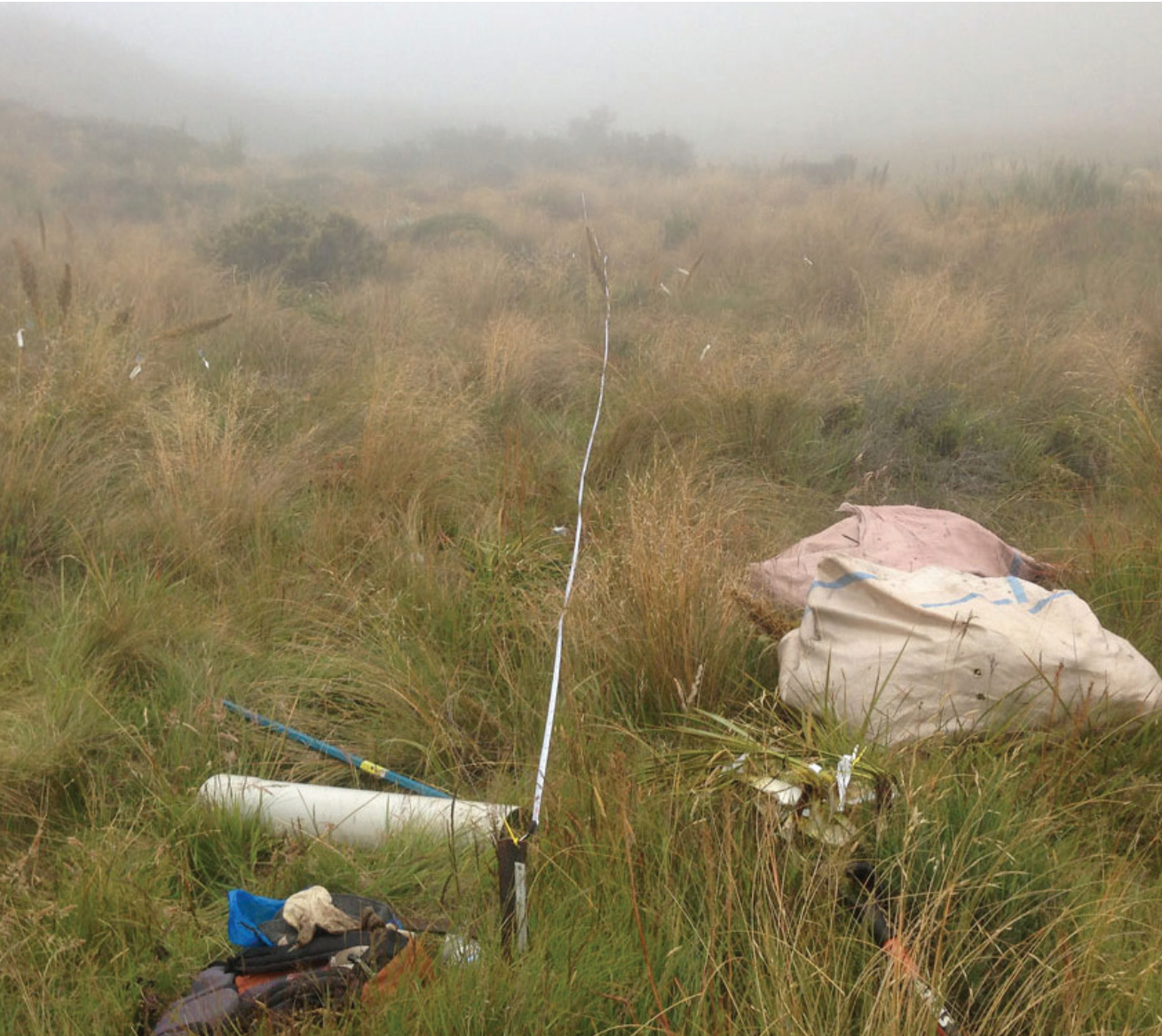
High country field work