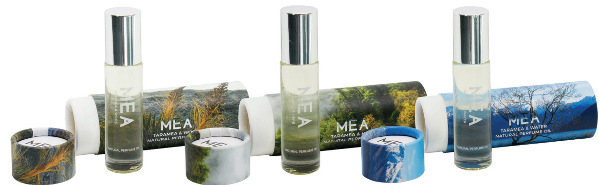
Taramea products produced by Ngāi Tahu